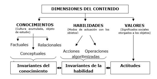
Fig. 1- Dimensions of learning content

The socio-critical historical way of reasoning contributes to the development strengthening of the logical processes of thought and constitutes one of the ways to carry out historical and socio-critical reasoning of the contents that favor not only learning objects of knowledge such as information. accumulated from contemporary local, national, international, multicultural and global contexts, but learn to transform information with the productive use of received messages, making those messages meaningful from a contextual location and appropriating the methods of science and technology, constituting this the mechanisms of self-formation from the dimensions of the content. (Díaz, 2010).