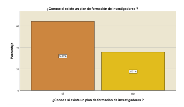
Fig. 2- Knowledge of teachers about training plans for teachers who carry out research

One of the objectives of the research is to share the results with the scientific community and the publication of the article in an indexed journal, when consulting the UEES teachers if they have published any scientific article, only 25.93% answered yes (figure 3).