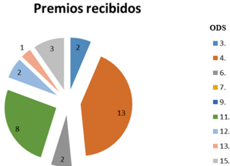
Fig. 2 - Contribution of CEMARNA to the objectives of sustainable development from the awards received

Award of Cuba and the Technological Innovation Award.